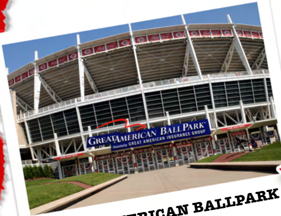
GREAT AMERICAN BALLPARK